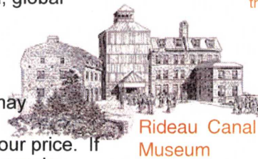
Rideau Canal Museum