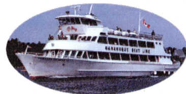
1000 Islands Scenic Cruise to see the Fall Colors!

Travel Industry Act. 1974 Wholesale: 1914409 Retail: 1914394 GST#: R121455737